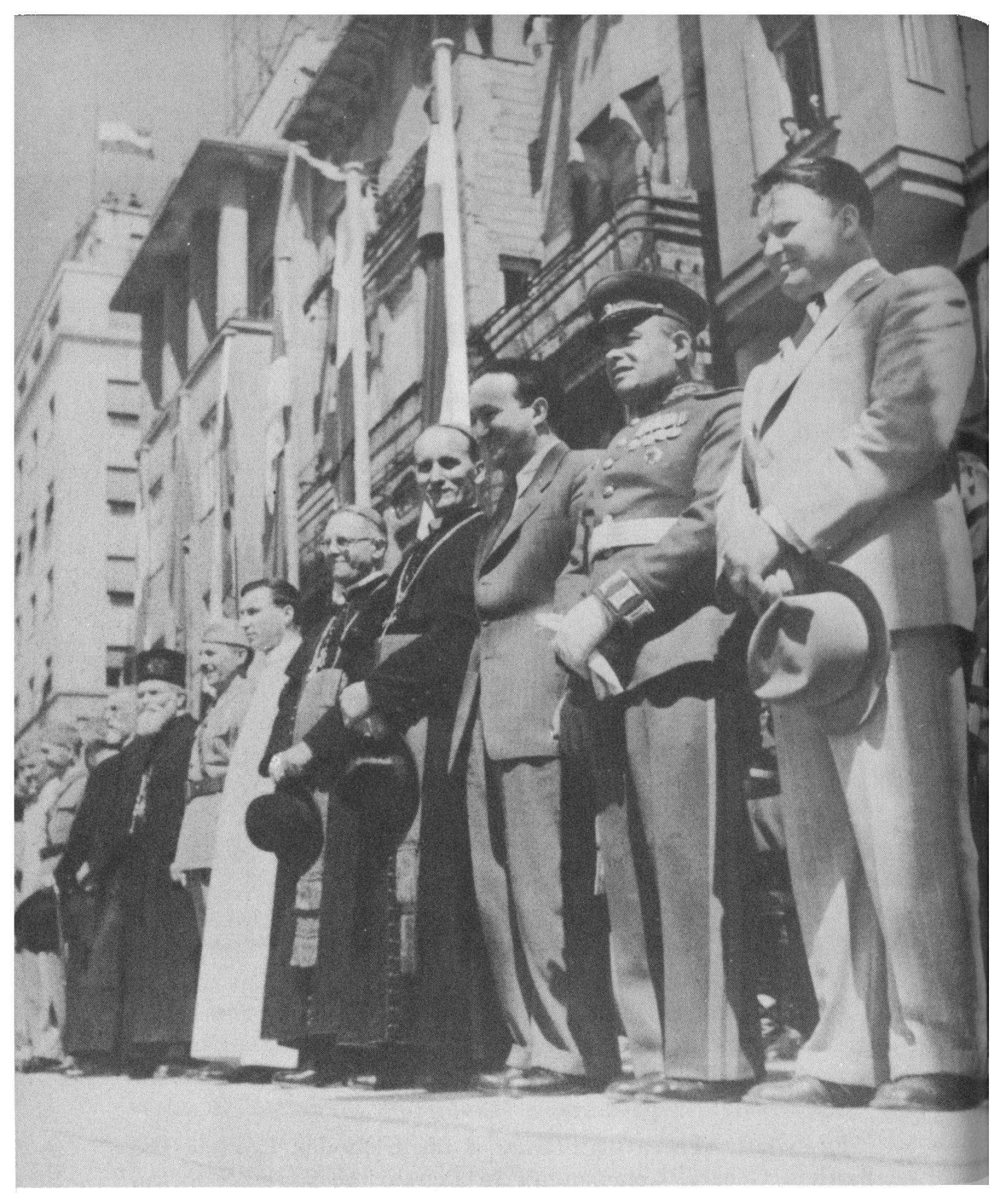
(Religious News Service)